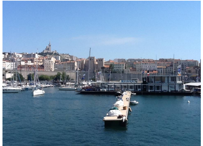
Marseille (second largest city in France) is the prey of much drug related violence

Our next newsletter (early January 2014) will keep you updated with the progress made toward this important step in the ministry of Reformed Faith and life-French . In the meantime, we would like to make a special appeal to you to help us budget properly for some relocation expenses that need to be