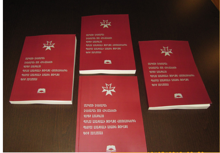
Proof copy of the N.T translation and Psalms

Please send your donations to the following address: