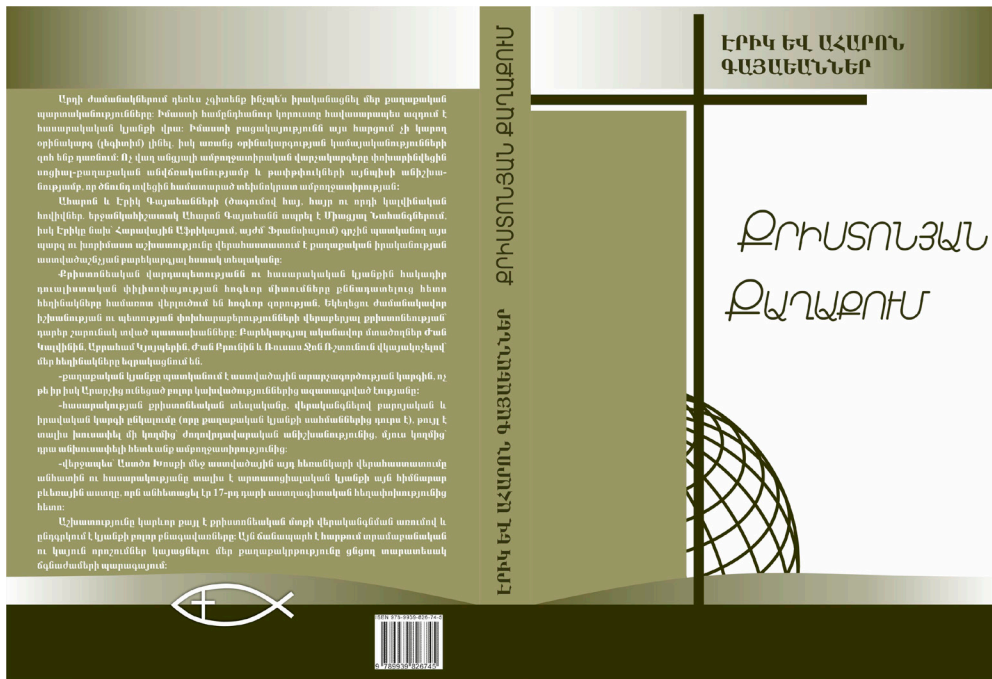
Cover photo for The Christian in the City

Please send your donations to the following address: