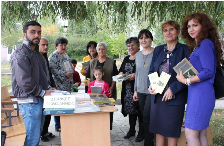
Book expo in the city of Gyumri featuring our publications.

Every town and village (regardless of topography), will be covered by the radio signal, a much better coverage than the national radio of Armenia. This is excellent and exciting news for the ministry of Christians for Armenia!