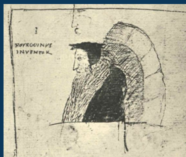
A contemporary drawing of John Calvin preaching, by one of his students

Keeping our sanity of mind amidst the insanities of earthly rulers | 2